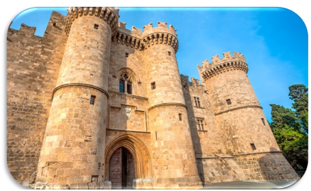
THE GRAND MASTERS HOME ON RHODES